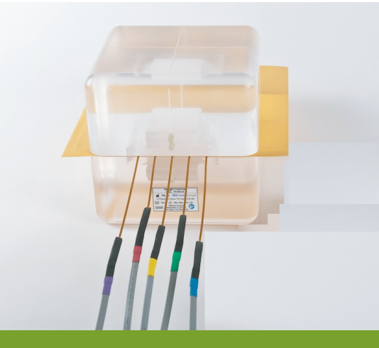
A Film placed between the two sub-phantoms using MOSFETs dosimeters for IMRT plan.