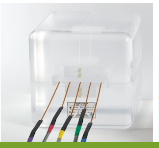
XWU-IMRT Phantom for 3D dosimetry using MOSFETs.

The XWU-IMRT Phantom (TN-RD-52) is ideal for obtaining quantitative dose measurements for film and MOSFET dosimetry. This 20cm x 20cm block phantom houses film and a minimum of nine MOSFET dosimeters on two orthagonal planes. One of the planes, containing five MOSFET detection points, is the dividing plane of the two sub-phantoms where a film is housed. Five absolute MOSFET dose points on the plane of the film provide dose verification. Easy to use cassettes come with pre-manufactured slots for the dosimeters and allow for greater versatility. (Additional cartridge for ion chamber comparison also available.)