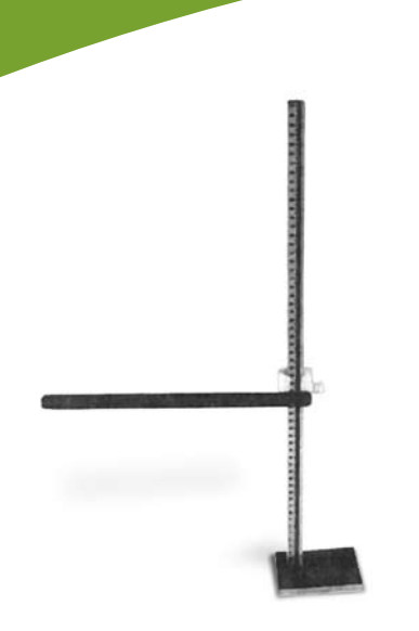
Table Top Caliper

The table top caliper with a 55 cm scale can only be used to measure from the table top to the top surface of the patient.