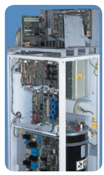
High Frequency Generator

Radiation therapy teams depend on accurate tumor volume definition and precise patient positioning for simulation. Huestis•Cascade™ Simulator's included diode line lasers, custom block tray adapter, and the highest quality imaging components ensure positioning accuracy. Its unique balance of smooth, precise controls contributes to ease of use, quick setups, and patient accessibility. Huestis•Cascade™ Simulator provides precision replication of patient positioning matched to common radiotherapy treatment requirements.