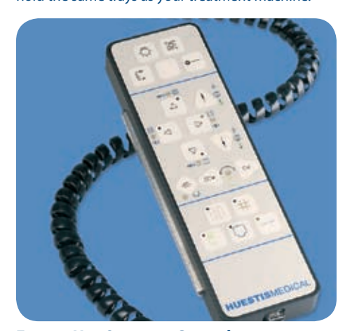
Easy to Use Operator Controls

Included custom block tray adapter matches your source-to-tray distance. This snap-in, positive locking design is lightweight and will hold the same trays as your treatment machine.