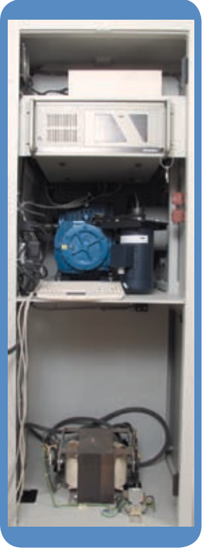
Rigid Construction, Reliable Components

Huestis•Cascade's<sup>™</sup> rigid gantry and pedestal construction maintain alignment accuracy. Reliable components and easily adjusted controls are built for years of trouble free service.