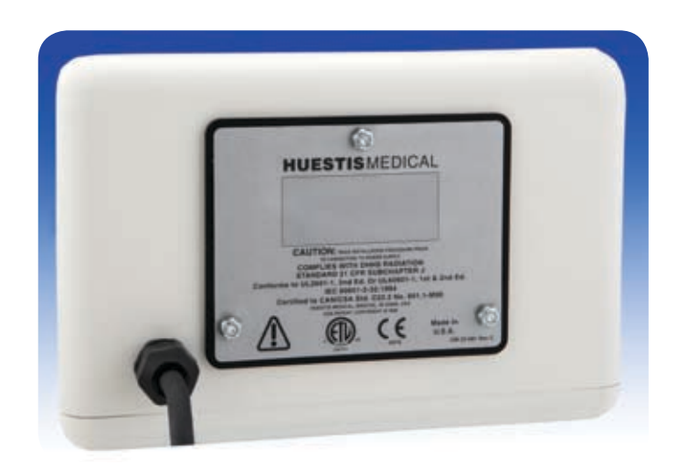
Easy access lamp replacement

Our CM-4201 Series is equipped for serial control (from custom software provided by customer) in a choice of RS232, RS485, or CANBUS protocols. The rotary input interface allows on-the-fly field size adjustments by the technician.