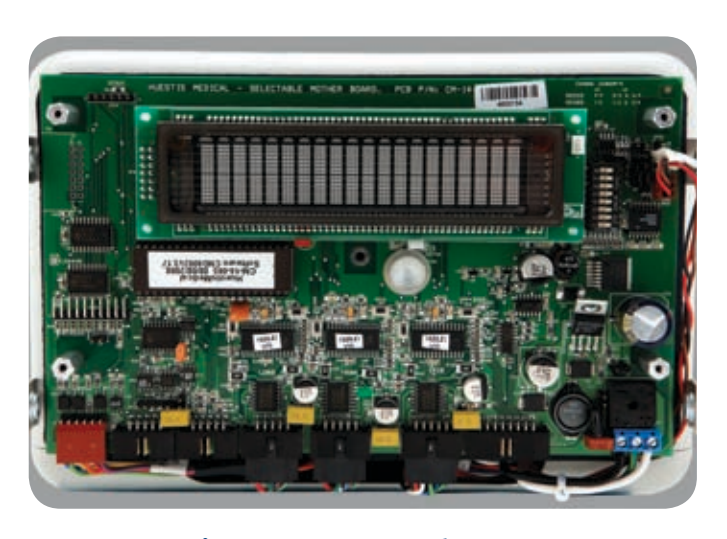
Microprocessor control system